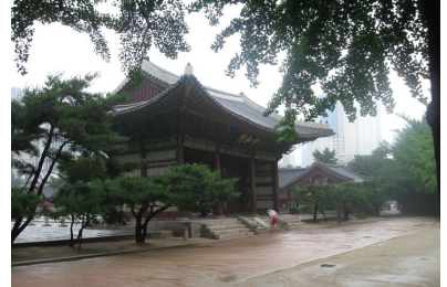
A tour of the countryside features graceful architecture.