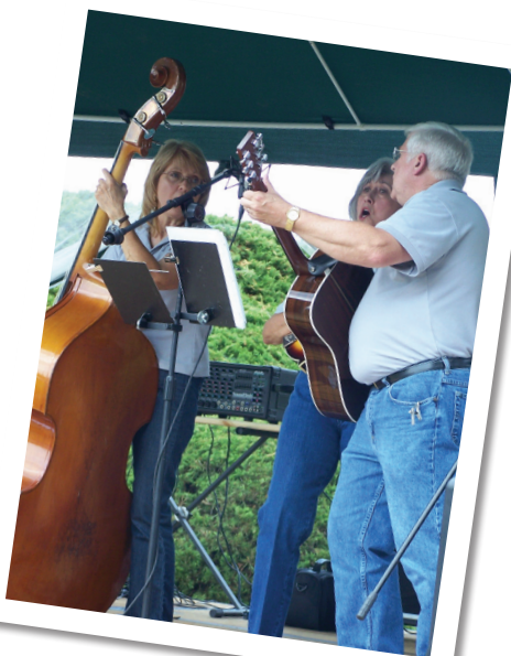
The Midnight Ramblers perform old-time music.