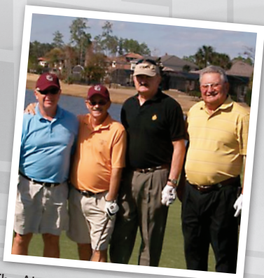
The Alumni Golf Outing in Lake Mary, Florida, is a great winter break!