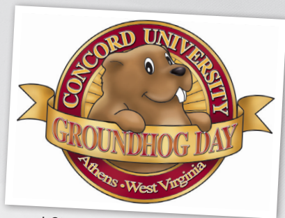
Concord Charlie shares his weather forecast at the annual Groundhog Day Breakfast.