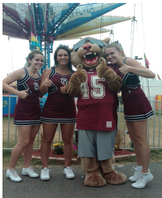
Roar and friends visit the fair.