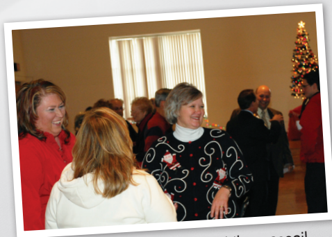
Holiday cheer abounds at the wassail.