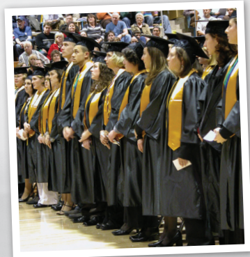
Students await their hard-earned moment at a recent commencement.