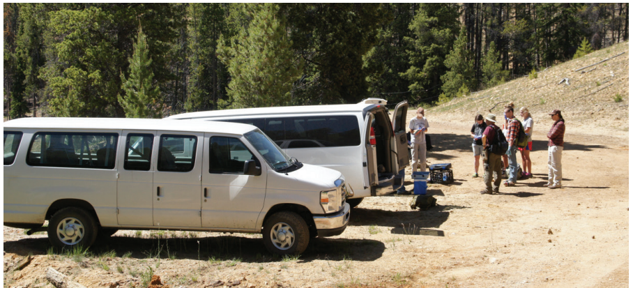
Students prepare for a day in the field near Leadville, Colo.

(vi) land-use planning, including transportation networks, engineering and construction, and the development of wind, solar, and conventional power plants.