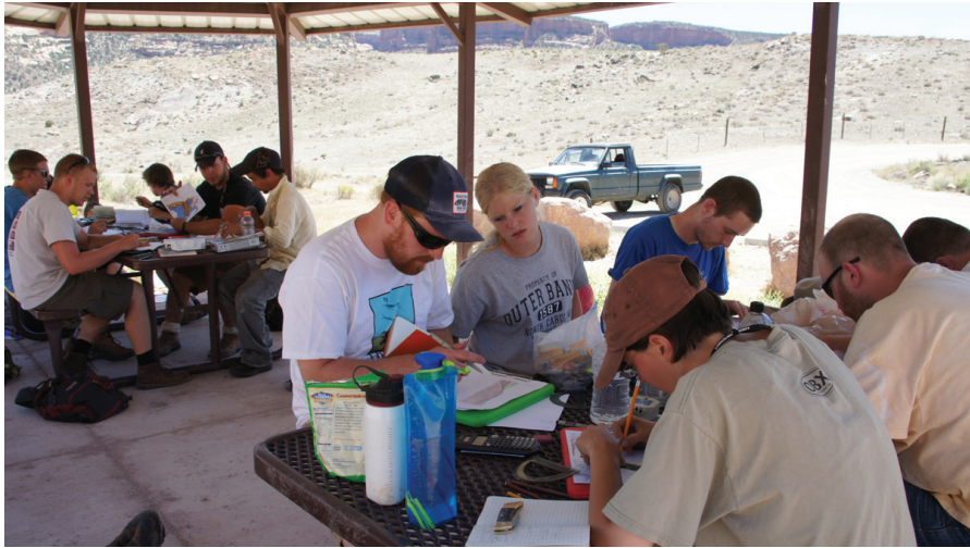
Students compile geologic maps in the shade following a two-day mapping exercise in the desert heat of Colorado National Monument. During the trip, students camped in tents at several locations throughout Colorado and Utah, and stayed in residence halls at Western State Colorado University in Gunnison, and Colorado Mountain College in Leadville.

also gain early field experience in the Appalachians during afternoon field exercises near campus and extended weekend field trips during the regular academic year.