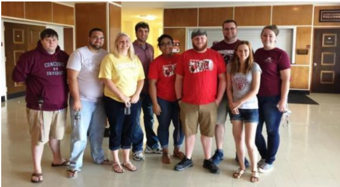
Our amazing Orientation Leaders 2015!