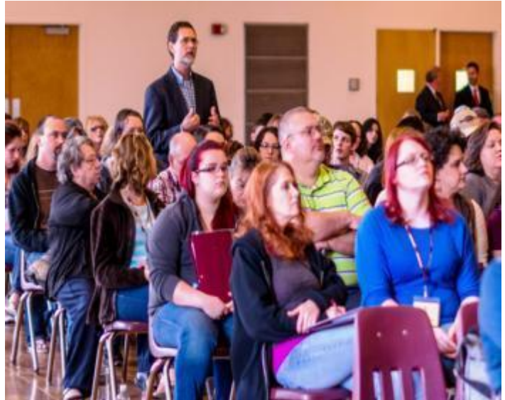
Question & Answer session