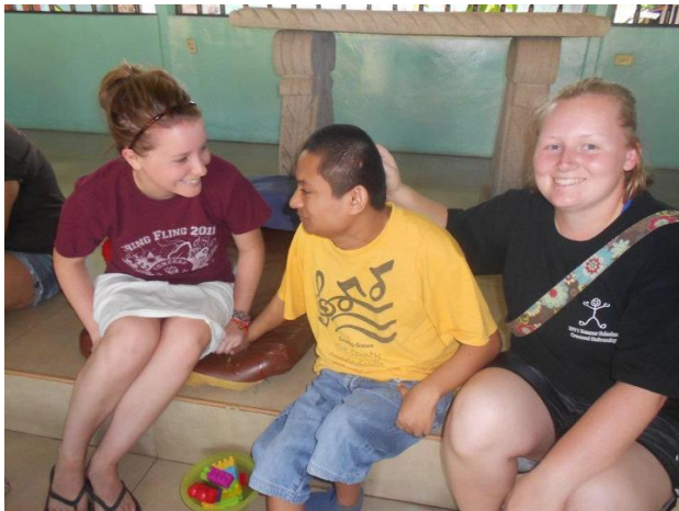
Visiting the special needs orphanage