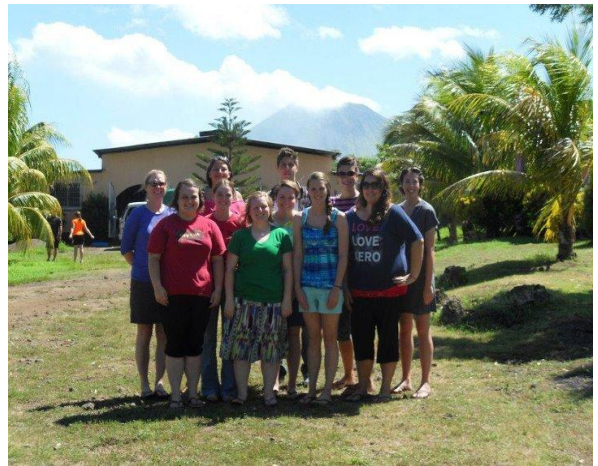
Bonner Scholars in front of Vision Nicaragua's Mission Center (Yes, there's a volcano in the background!)