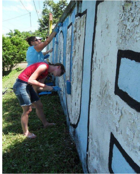
Painting Vision Nicaragua's Mission Center