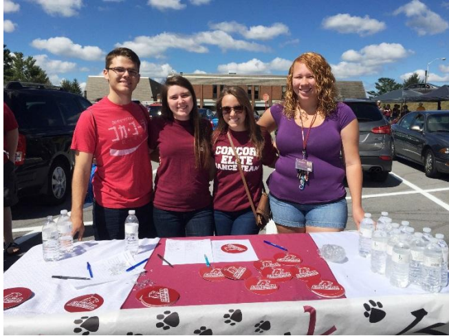
First Student Affairs Football Tailgate Sponsored by Bonner Scholars