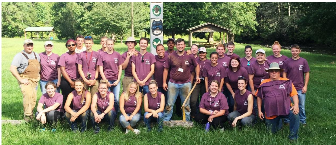
New 2016 Bonner Scholars & Orientation Leaders