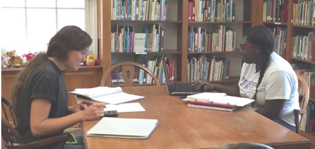
Students even managed some Library study time during Welcome Week!

We're off to a Great Start for 2016-2017!!