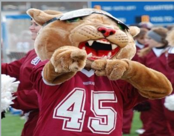
Concord's Mascot "Roar"