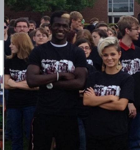
Some scenes from Fall 2014 Orientation!!